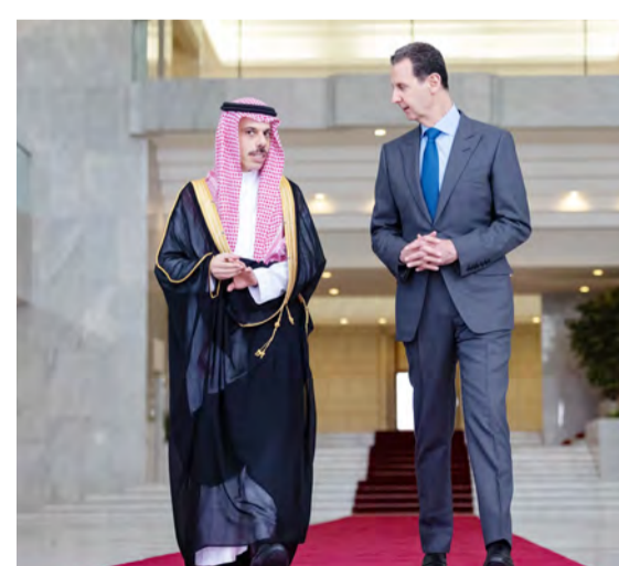
DAMASCUS: Syrian President Bashar Al-Assad met with Saudi Arabia's top diplomat in Damascus on Tuesday, ending more than a decade of diplomatic deep-freeze between the two countries.

stages of the war. Several other Arab countries also cut ties with Syria as some powers bet on Assad's demise. But regional capitals have gradually been warming to Assad as he has clawed back most of the territory lost to rivals, with crucial backing from Russia and Iran. The United Arab Emirates, which re-established ties in late 2018, has been leading the charge to reintegrate Damascus into the Arab fold.