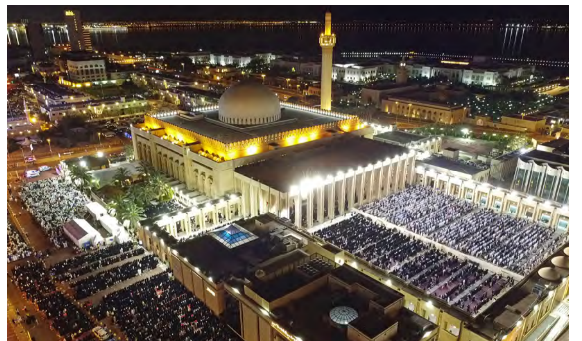
KUWAIT: An aerial view shows Muslims performing qiyam ul-layl prayers at the Grand Mosque on April 18, 2023 on the 27th night of the holy fasting month of Ramadan.

Saudi Arabia severed ties with Assad's government in 2012 and Riyadh had long openly championed Assad's ouster, backing Syrian rebels in earlier