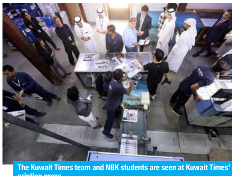
The Kuwait Times team and NBK students are seen at Kuwait Times' printing press.