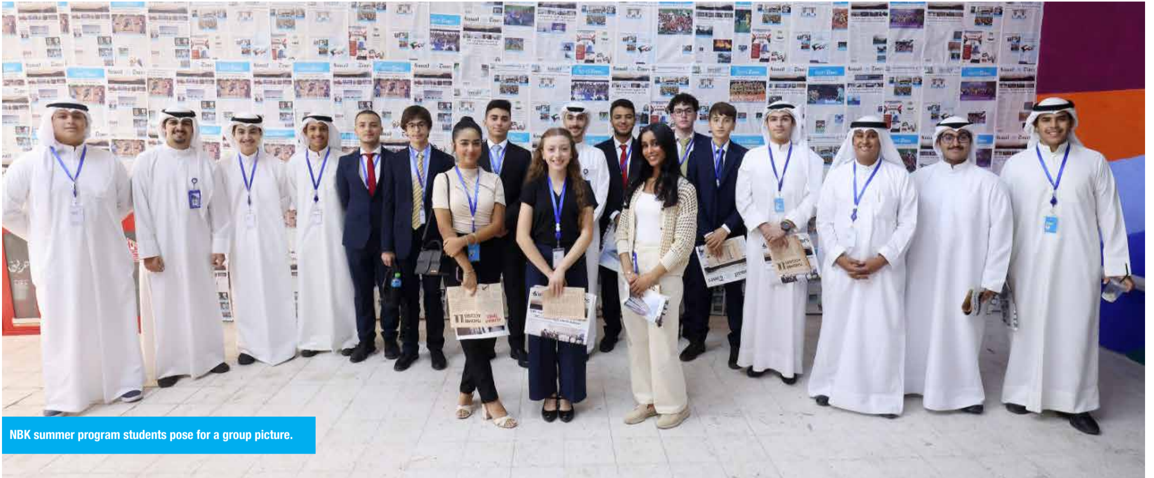
NBK summer program students pose for a group picture.

Students toured newsroom, discussed future of journalism