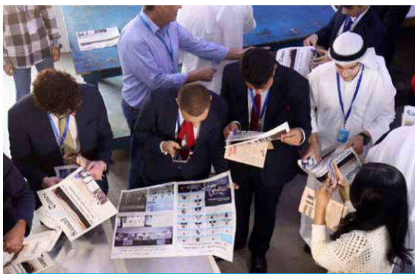
NBK students examine exclusive printed newspaper copies that cover their visit to Kuwait Times.

From the present and future of journalism, the students traveled back to the past as they were taken to Kuwait Times' archives to witness the history preserved in pages. The students also toured the printing press, where they saw the printers print newspaper copies published exclusively for them. The issue covered the students' visit to Kuwait Times and included their pictures, which delighted them and increased their interest in the overall progress of media and journalism. The Kuwait Times and Kuwait News team ended the tour by offering refreshments and snacks for everyone to enjoy.