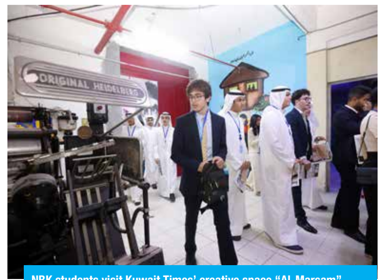
NBK students visit Kuwait Times' creative space "Al-Marsam".