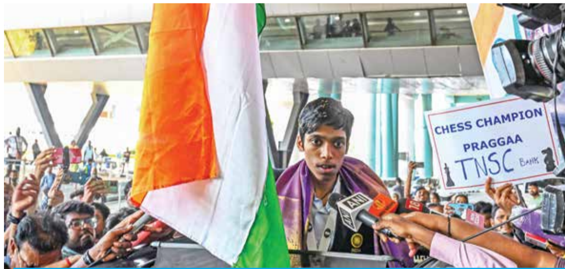
CHENNAI: India's chess grandmaster and silver medalist Rameshbabu Pragganandhaa, responds to a television media personnel as he is welcomed upon his return from the FIDE Chess World Cup in Baku, at the Chennai International airport in Chennai, on Aug 30, 2023.

In 2018 - aged just 12 years, 10 months and 13 days - Pragg became the world's then second-youngest chess grandmaster. Chess has gained in popularity in India in the past two decades after Vishwanathan Anand became the country's first grandmaster aged 18 in 1988 and dominated the game in the 2000s. A predecessor to chess is thought by some to have originated in India in the sixth century AD, from where it spread to Persia and developed into the "Game of Kings" it is today.