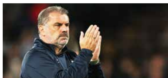
Head Coach Ange Postecoglou

Bournemouth boss Andoni Iraola earned his first win in English football as Ryan Christie's last-gasp goal clinched a 3-2 victory at second-tier Swansea. The Spaniard had overseen a draw with West Ham and defeats by Tottenham and Liverpool in his first three league games. Brentford needed a 3-0 penalty shoot-out victory to advance after a 1-1 draw at fourth-tier Newport. Crystal Palace survived a scare as they fought back from two goals down to win 4-2 at second-tier Plymouth thanks to Jean-Philippe Mateta's hat-trick.— AFP