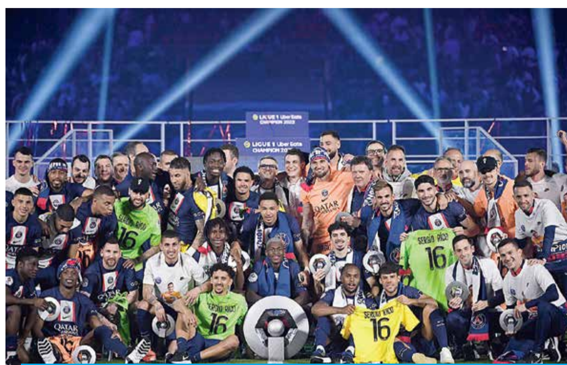
PARIS: Paris Saint-Germain players celebrate their French L1 championship during the 2022-2023 Ligue 1 trophy ceremony at the Parc des Princes Stadium on June 3, 2023.

Maurizio Sarri's side secured their best league placing since they last won the Scudetto 23 years ago. Relegated Cremonese bowed out of Serie A in a pos-