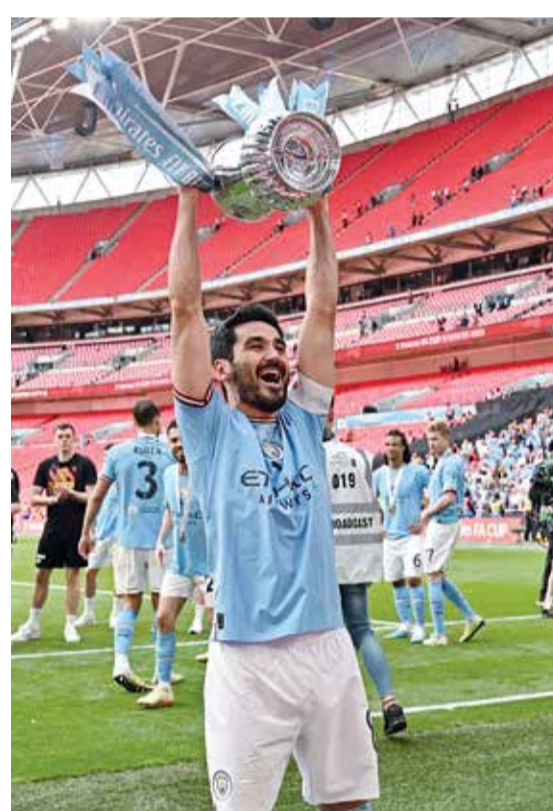
LONDON: Manchester City's German midfielder Ilkay Gundogan celebrates with the English FA Cup trophy at Wembley stadium on June 3, 2023.