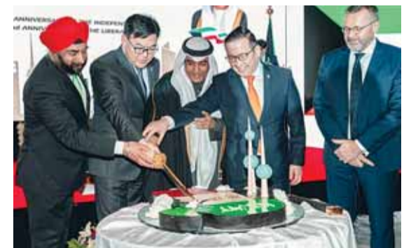
The Kuwait Embassy in Mongolia celebrates the national holidays.

Al-Houri appreciated Kuwait's contributions to the economic development in Sudan and its limitless support to the relief efforts during times of hardship. He expressed best wishes for Kuwait, congratulating