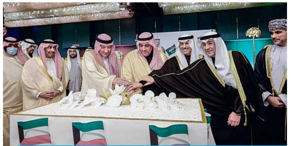
Kuwait Embassy in Saudi Arabia celebrates national holidays.