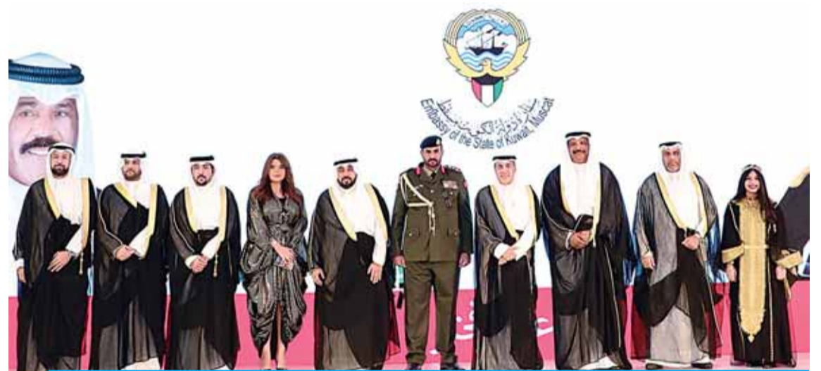
Kuwait Embassy in Oman celebrates the national holidays.