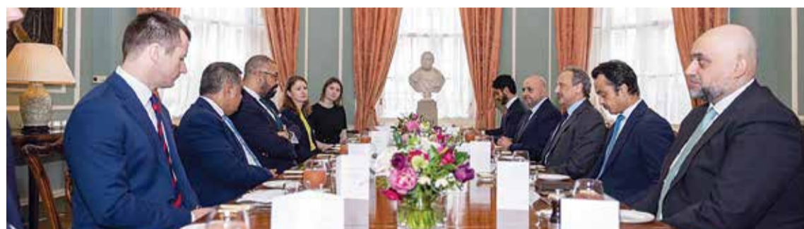
LONDON: Kuwait's Minister of Foreign Affairs Sheikh Salem Abdullah Al-Jaber Al-Sabah met with MP of the UK House of Commons Nigel Evans, head of the Foreign Affairs Committee Alicia Kearns and head of the parliamentary group at the House of Lords Rehman Chishti, as part of his UK visit on Monday.

Sheikh Salem, at start of the meeting, conveyed sincere greetings from His Highness the Amir Sheikh Nawaf Al-Ahmad Al-Jaber Al-Sabah, His Highness the Crown Prince Sheikh Mishal Al-Ahmad Al-Jaber Al-Sabah; addressed to King Charles III, the Monarch of the United Kingdom of Great Britain and North Ireland. He also relayed identical salutes from His Highness the Prime Minister Sheikh Ahmad Nawaf Al-Ahmad Al-Sabah toward the UK leadership, government and people, lauding the solid, historic and