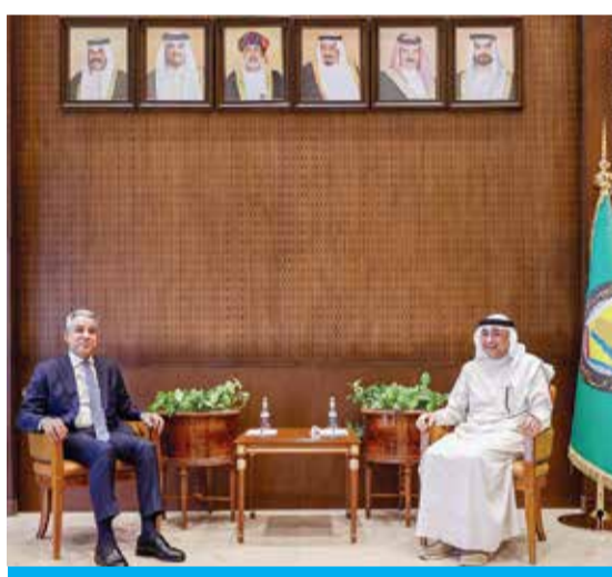
Secretary General of the Gulf Cooperation Council (GCC) receives Iraq's Ambassador to Saudi Arabia.