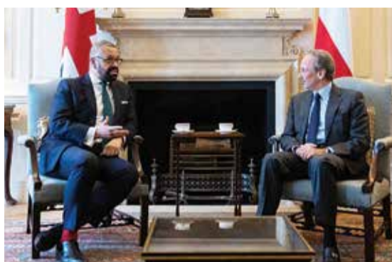
LONDON: UK, Kuwait hold strategic dialogue on boosting ties, cooperation.

During the meeting, the two sides discussed enhancing partnership and implementing the action plan in all domains through political and security dialogue, and investment and commercial cooperation, and cultural and sports activities, according to the statement. They further reviewed the GCC-Iraqi ties and means of developing and enhancing them to serve their common interests, in addition to discussing the most outstanding challenges and crises on regional and international arenas, the statement concluded.