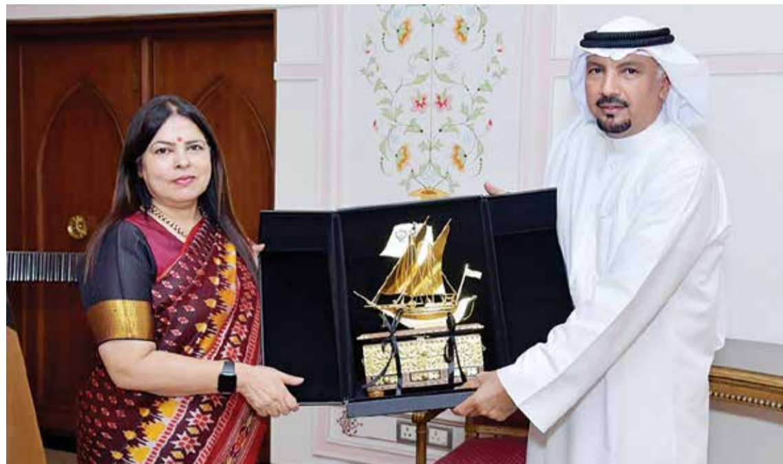
Indian Minister of State for Foreign Affairs and Culture Meenakshi Lekhi meets Kuwaiti Ambassador Jassem Ibrahim Al-Najim.

"GCC as a trade bloc is the largest trade partner to India with a total trade of 154 billion dollars in 2021-22," it said adding people-to-people ties need to be further enhanced. The discussion