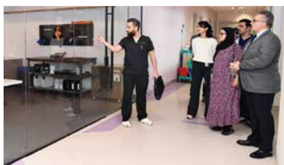
KUWAIT: Jaber Hospital held a five-day workshop during which five delicate pediatric neurosurgeries were carried out, including one that was done for the first time in Kuwait.

They also reviewed the process of joint cooperation between both sides, in addition to conversing the most prominent developments regionally and internationally. During the meeting, ways to enhance joint cooperation between the two sides were discussed to support efforts to establish peace, stability and security in the Middle East, in a way that benefits both sides. —KUNA