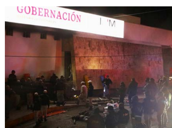
CIUDAD JUAREZ: Firefighters and police rescue migrants from an immigration center, where at least 39 people were killed and dozens injured after a fire.