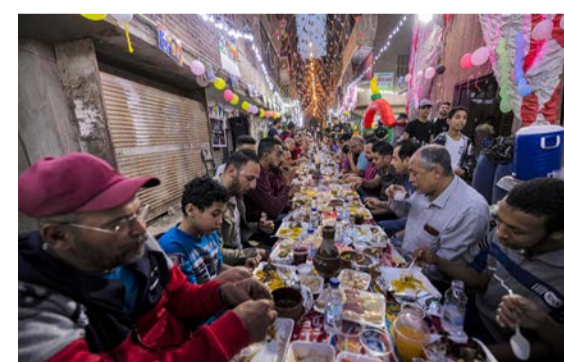
CAIRO: In this file photo taken on April 16, 2022, Muslims gather along street-long tables to break their Ramadan fast together in the Matariya suburb.