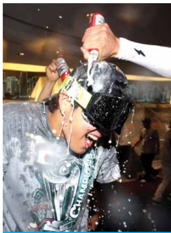
MIAMI: Shohei Ohtani #16 of Team Japan celebrates in the clubhouse after defeating Team USA in the World Baseball Classic Championship 3-2 at loan-Depot park.

Among these deals was a nine-year contract worth $360 million for 2022 AL MVP Aaron Judge to stay with the New York Yankees and pitcher