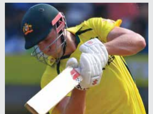
Australia's Cameron Green