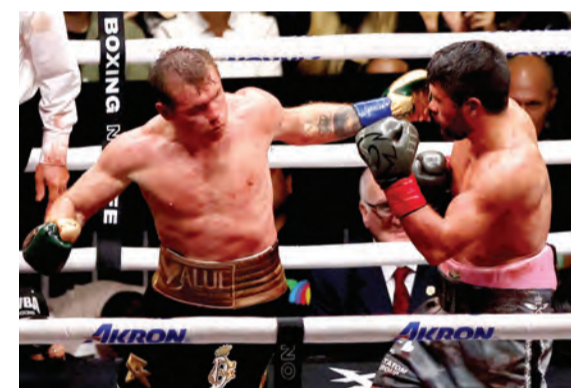
GUADALAJARA: Mexican boxer Saul "Canelo" Alvarez (left) fights British boxer John Ryder (right) during their boxing match for the WBA, WBC, IBF and WBO super middleweight titles at Akron Stadium in Guadalajara, Jalisco State, Mexico.

After a tentative opening round, the 32-year-old Alvarez began to open up, landing a bevy of right hands that had Ryder bleeding from the nose and