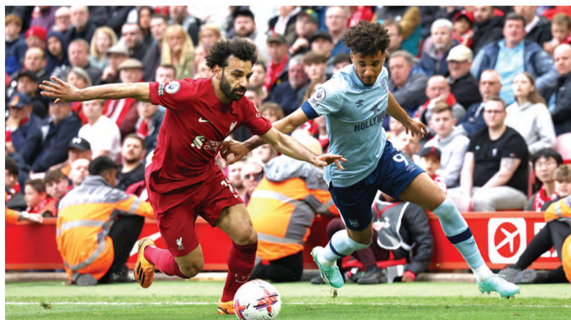
LIVERPOOL: Liverpool's Egyptian striker Mohamed Salah (left) fights for the ball with Brentford's German midfielder Kevin Schade (right) during the English Premier League football match between Liverpool and Brentford at Anfield in Liverpool.

In the men's final on Sunday home favorite and world number two Carlos Alcaraz is aiming to defend his title against German lucky loser Jan-Lennard Struff.