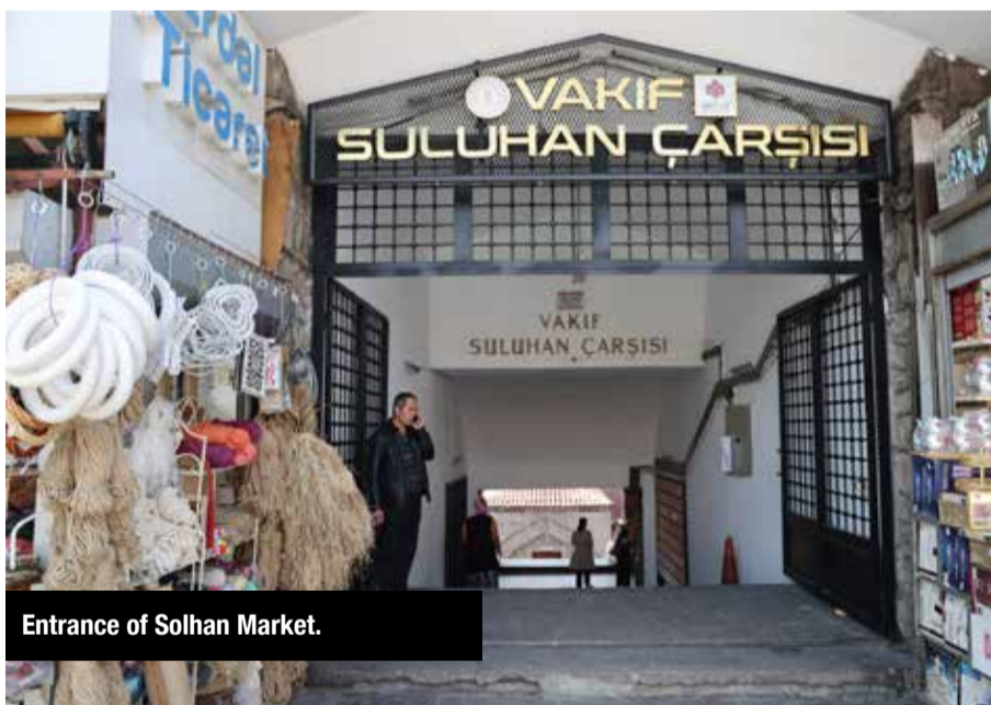
Entrance of Solhan Market.