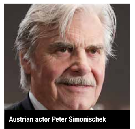
Austrian actor Peter Simonischek

The bittersweet father-daughter tale features Sandra Hueller and Simonischek, who created an indelible portrait of a sad clown. Britain's The Daily Telegraph newspaper gave the "exquisite" movie five out of five stars. "Not only does German humor exist, it might just save your life", it said. — AFP