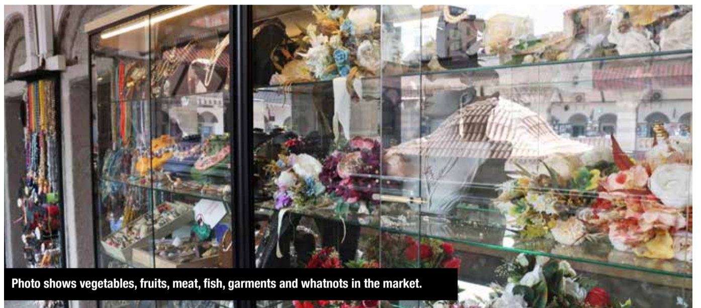
Photo shows vegetables, fruits, meat, fish, garments and whatnots in the market.

The United Nations' weather agency announced Tuesday it was making the cryosphere a new top priority, saying the melting of sea ice, glaciers and permafrost posed a global threat. Member states at the UN's World Meteorological Organization are concerned about the impacts of melting ice on sea levels, natural disasters, ecosystems and economies.