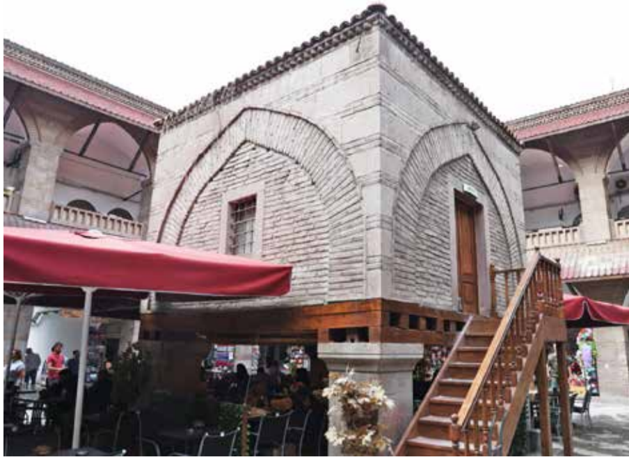
The market is one of the oldest buildings in the Turkish capital.