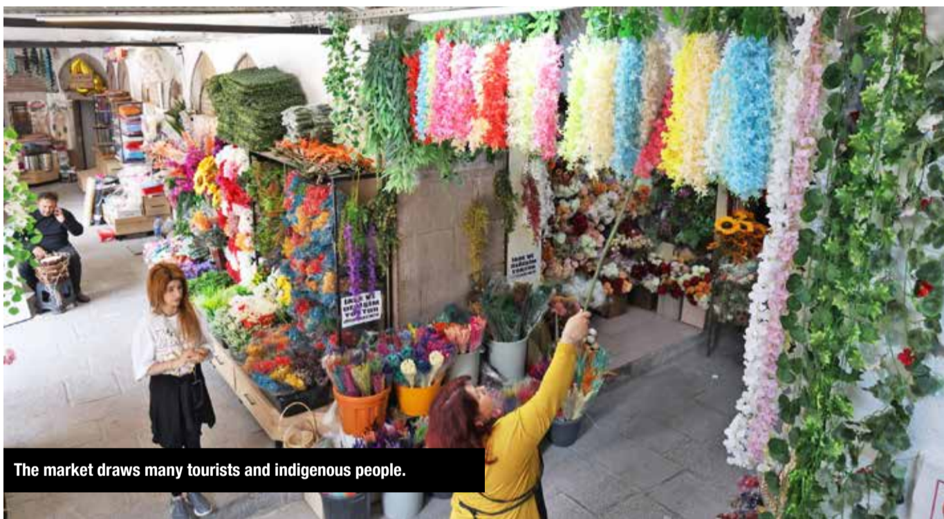
The market draws many tourists and indigenous people.

Being one of the oldest markets in the Turkish capital, Ankara, Solhan Market is an archaeological building that was built more than 500 years back. Located in the touristic Ulus region, the two-storey building has turned out to be a popular market that draws many tourists and indige-